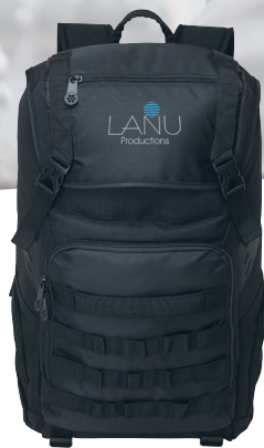
KB4301 WORK-Out Backpack As low as: $42.99