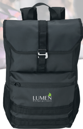
KB4300 WORK-Day Backpack As low as: $36.99