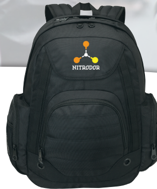
KB4302 WORK-Pro Backpack As low as: $54.99