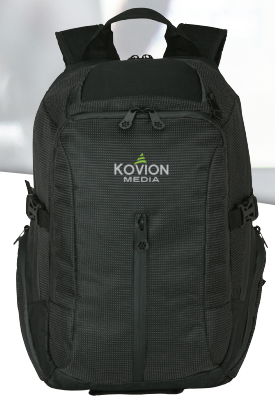
KB4303 WORK-Pro II Backpack As low as: $56.99