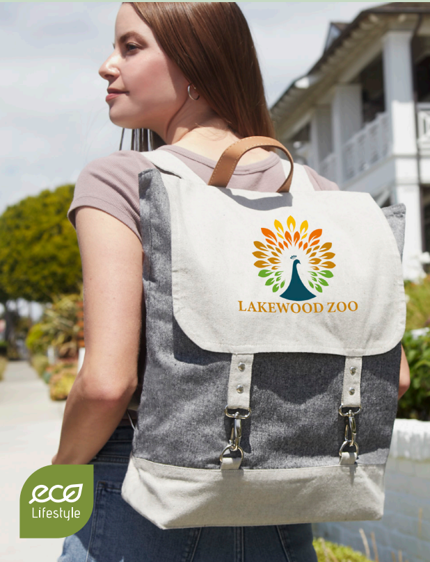
KL7201 BETTONI® CLASSICO RPET HANDLED BACKPACK

Crafted from an 80% recycled cotton and 20% polyester blend