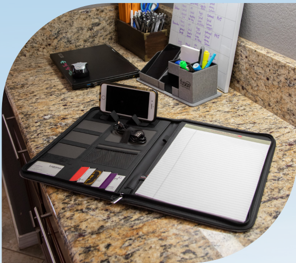
KP4147 STERLING RPET ZIPPERED LETTER SIZE PADFOLIO As low as: $29.99 c