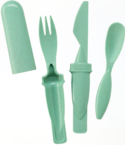
VR3110 ARROYO II BAMBOO FIBER CUTLERY SET As low as: $1.19 c