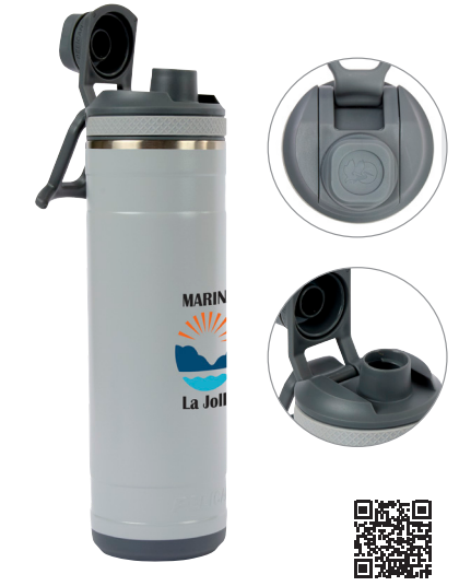
PELICAN PACIFIC™ CHUG 26 OZ. RECYCLED DOUBLE WALL STAINLESS STEEL WATER BOTTLE PL1507