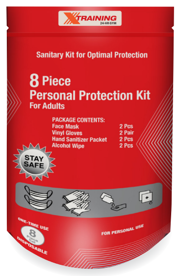
8 Piece Personal Protection Kit

VL2902 as low as $5.99(c) Set up $56.00(g)