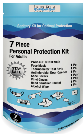
7 Piece Personal Protection Kit

VL2901 as low as $4.99(c) Set up $56.00(g)