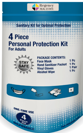
4 Piece Personal Protection Kit

VL2900 as low as $3.99(c) Set up $56.00(g)