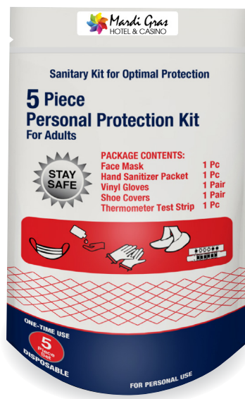
5 Piece Personal Protection Kit

VL2900 as low as $3.99(c) Set up $56.00(g)