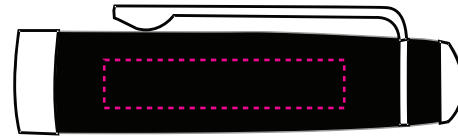
Cap - Right read (standard)